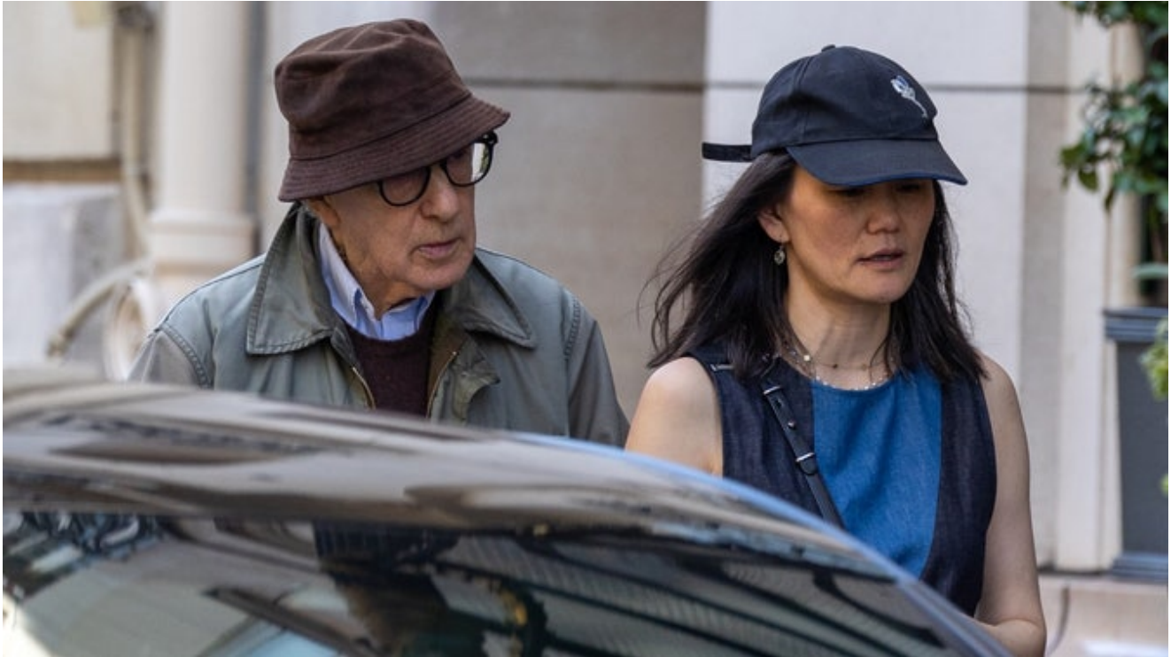
Director Woody Allen and wife Soon-Yi Previn are seen in Paris on Oct. 27, 2022.

"In retrospect, [Epstein] seems to be a terrible version of Dr. Jekyll and Mr. Hyde, but at the time seemed to be an intelligent person, socially well-connected and of wide areas of interest, from science to geopolitics," Barak told the outlet.