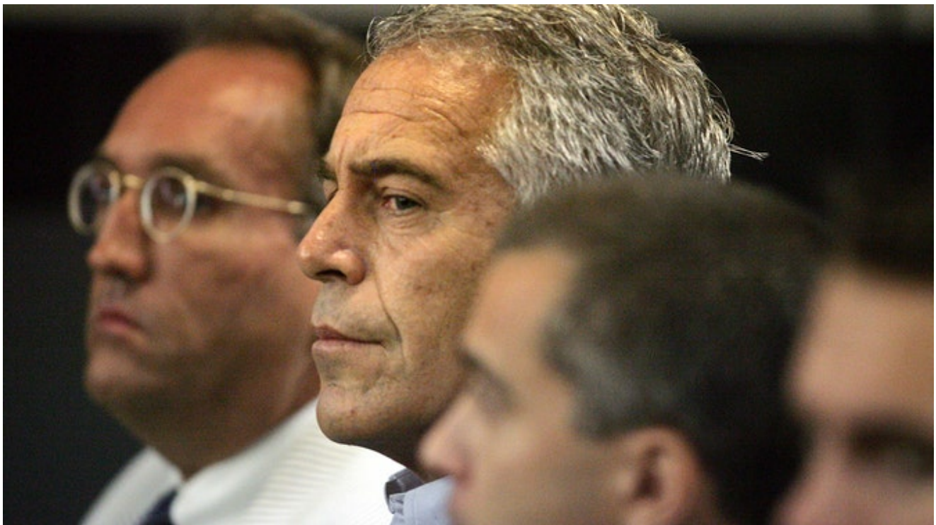
Jeffrey Epstein appears in court in West Palm Beach, Fla., on July 30, 2008.

The Journal noted it was unable to prove if all the scheduled meetings with powerful figures occurred or what their purpose was, but that the majority of people reporters spoke to said they met with Epstein for donations or to make powerful connections.